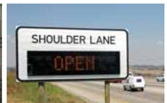
Johannesburg, (South Africa)