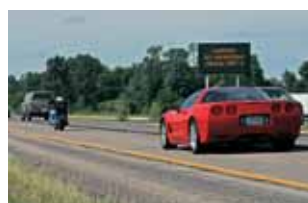
Ankeny, Iowa (USA)