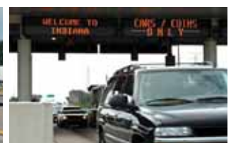
Indiana Toll way, (USA)